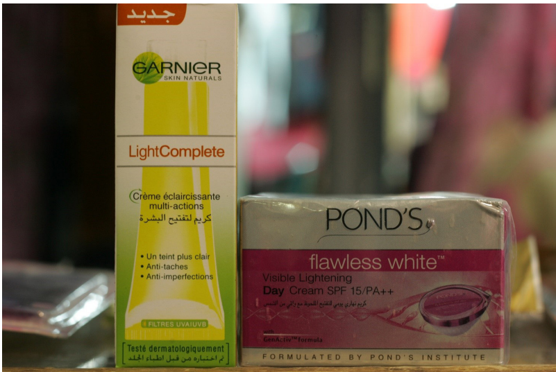
4. Skin-whitening creams. Market in Gabes, southern Tunisia.