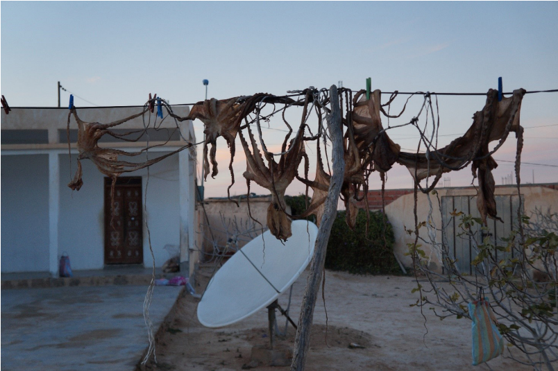
7. The courtyard of a house in Gosbah, with octopuses hanging to dry in the sun.