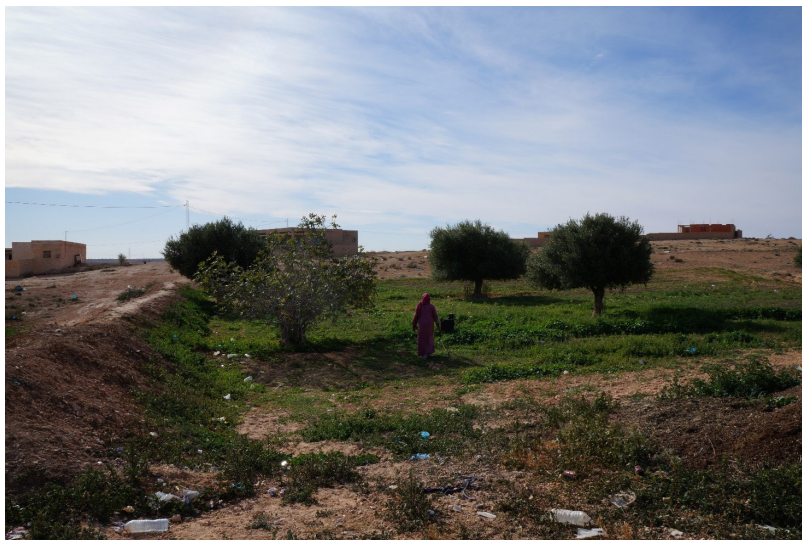
2. A woman working the land in Gosbah.