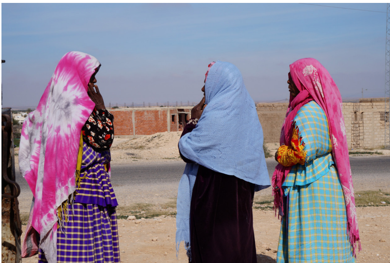
1. Abid Ghbonton women, waiting for the trucks on the main road of Gosbah.