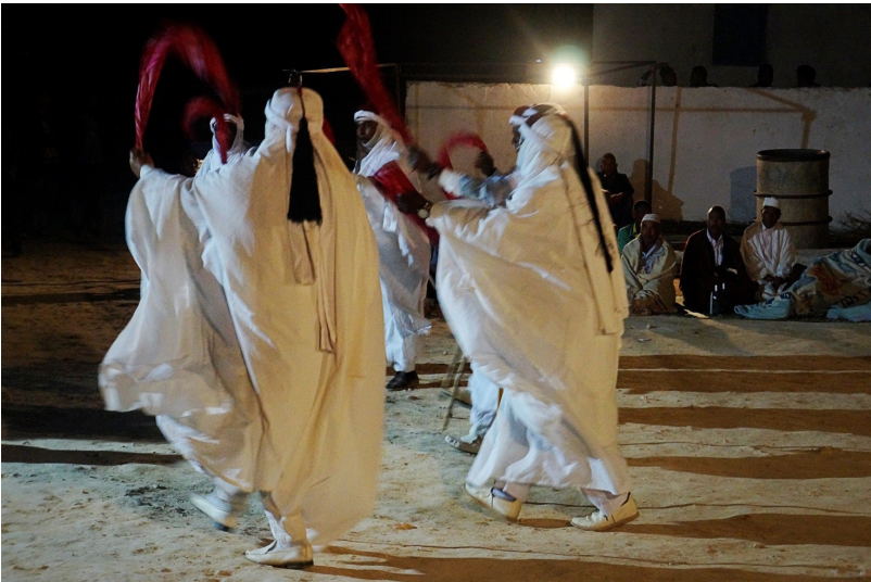
6. Tayfa singers dancing and waving the red neckerchief.