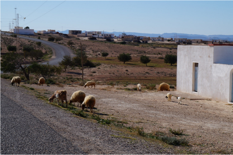
9. Main street in Gosbah leading to the higher part (fūq) of the village.