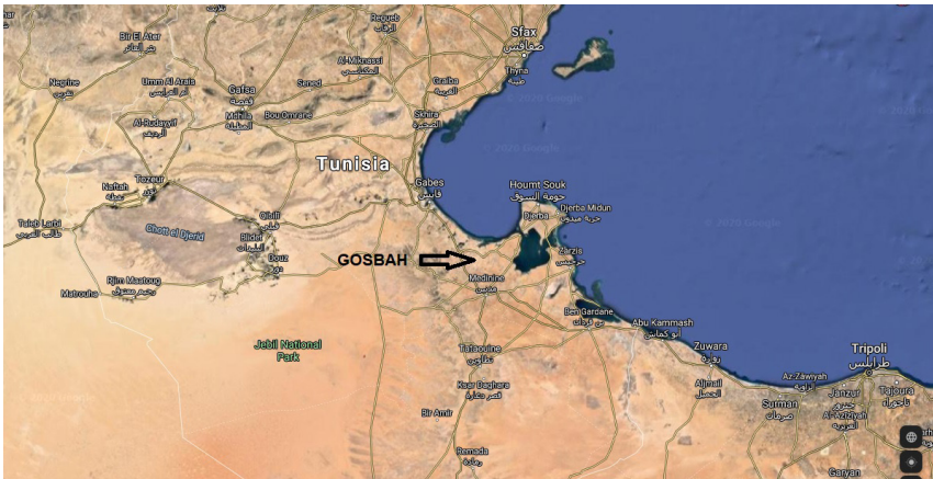
11. Gosbah in Tunisia.