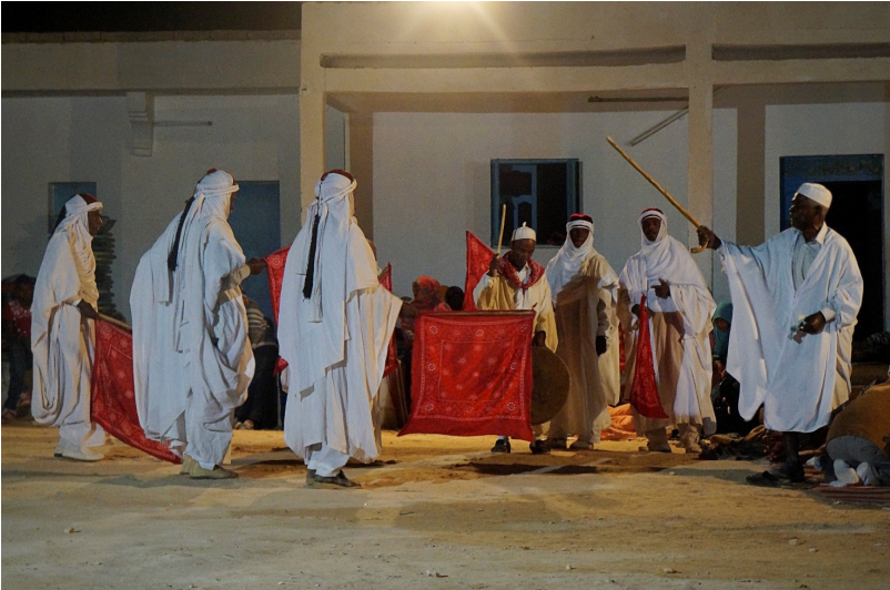
5. Tayfa singers performing at a wedding in Gosbah.