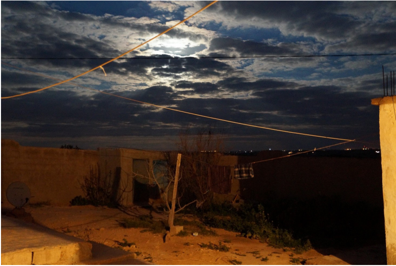
3. Internal courtyard of a house in Gosbah at dusk.