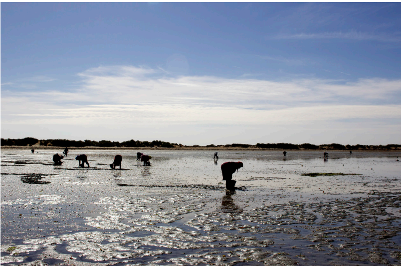
8. Women collecting babüch (clams).