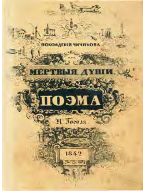
2. N.V. Gogol', Book cover for Dead Souls (1842)