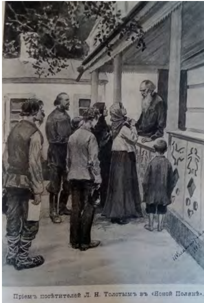
“Tolstoi’s reception of visitors to Iasnaia Poliana” (Supplement to Peterburgskii listok , 28 August 1908)

L. N. Tolstym”); to the communication of a newspaper correspondent who had once been at Iasnaia Poliana and who now offered the reader a detailed chronicle of Tolstoi’s daily routine—and, per the newspaper’s inclination to scandal, a not precisely idyllic description of the living conditions of peasants at Iasnaia Poliana. The material on the jubilee ended with a contribution entitled “Tolstoi in Anecdotes” (“Tolstoi v anekdotakh”): according to a widespread practice, various kinds of news on Tolstoi were assembled here, strictly without indicating their sources, and casually placed next to the reports of a murder or a cholera epidemic in St. Petersburg. The supplement to Peterburgskii listok , in line with the newspaper’s vocation as a champion of the rights of the meekest, emphasized Tolstoi’s “humanitarian side.” The images indeed seem to focus on Tolstoi’s relationship with the poor and the needy: in one photograph, peasant children are shown sitting next to the so-called “tree of the needy” in Iasnaia Poliana, while another drawing immortalises Tolstoi in the act of meeting the poor on his estate’s veranda.