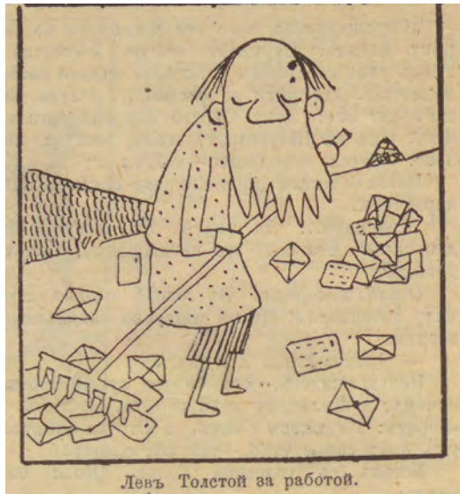
“Tolstoi at work” ( Seryi volk , 23 March 1908, n. 12)

The ongoing debate in the press went hand in hand with an exponential increase in the mail arriving at Iasnaia Poliana. Tolstoi's archive in Moscow contains over fifty thousand letters addressed to him, still largely unpublished, reflecting the lively dialogue between Tolstoi and his contemporaries: almost half of these letters reached Tolstoi in the decade before his death, between 1900 and 1910; of these, over four thousand date back to 1908; of these, those that refer to the jubilee number 1,364. 16 Even the periodicals publicized the extraordinary flow of letters addressed to Tolstoi, from Russia and from abroad, offering brief samples of their various types, and sometimes even indulging in satirical interpretations of the phenomenon. 17