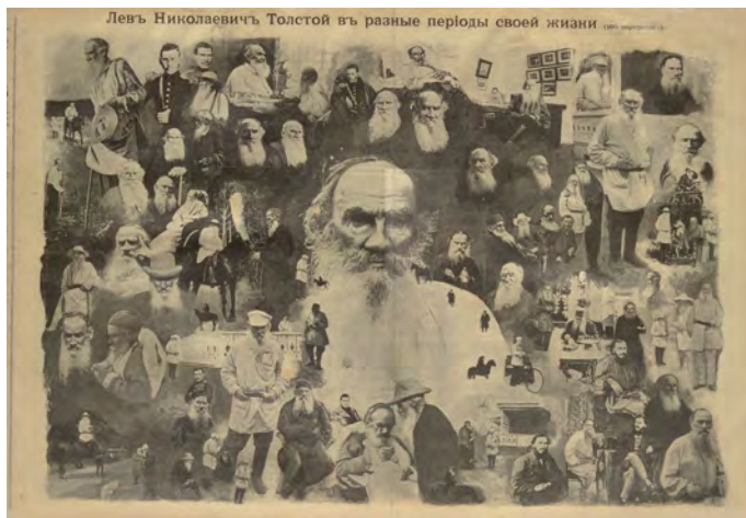
“Lev Tolstoy in different periods of his life” ( Iskry , 24 August 1908, n. 33)